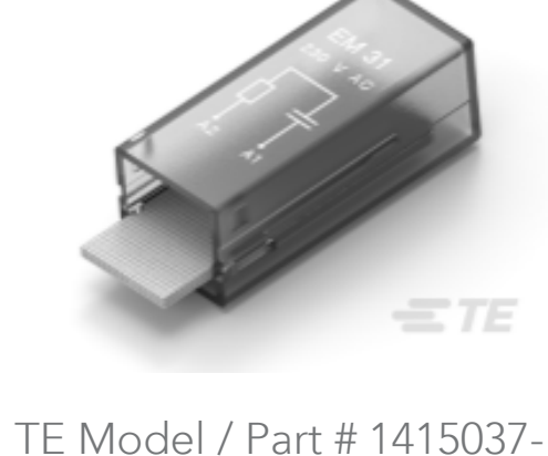
1 E Model / Part # 141503/ 2