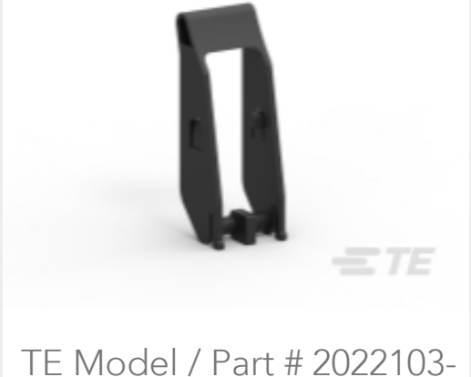
TE Model / Part # 2022103-