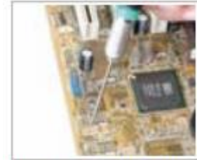
PCB layout cutting