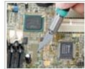
IC, component pin cutting