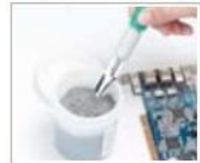
Solder paste & glue