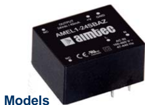
Models Single output